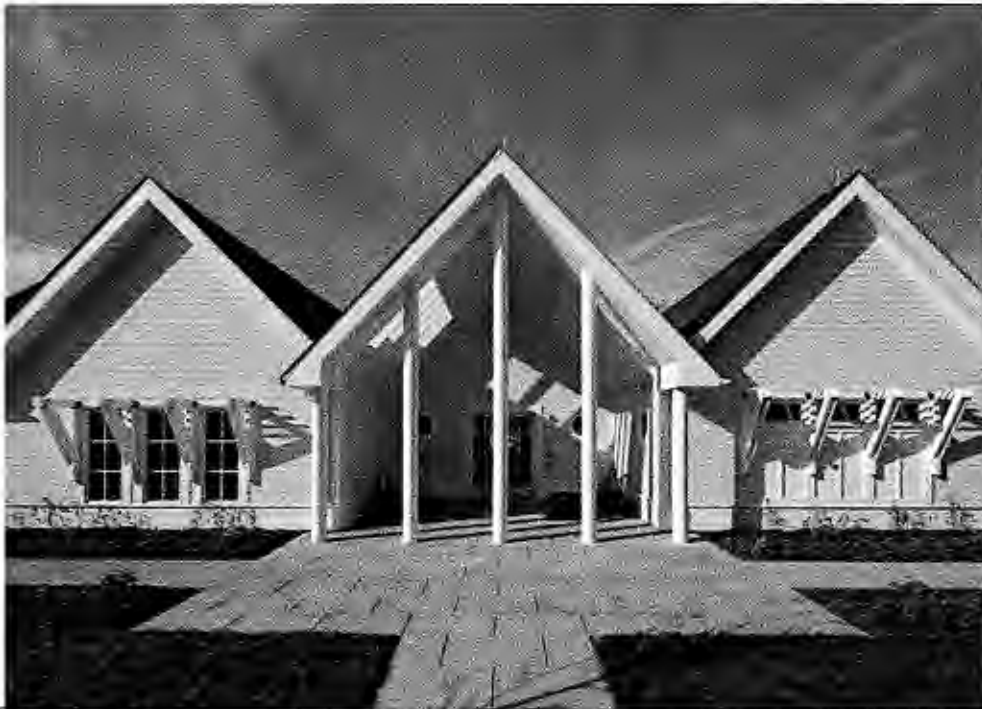
Graves, "Wounded Warrior Home entrance"